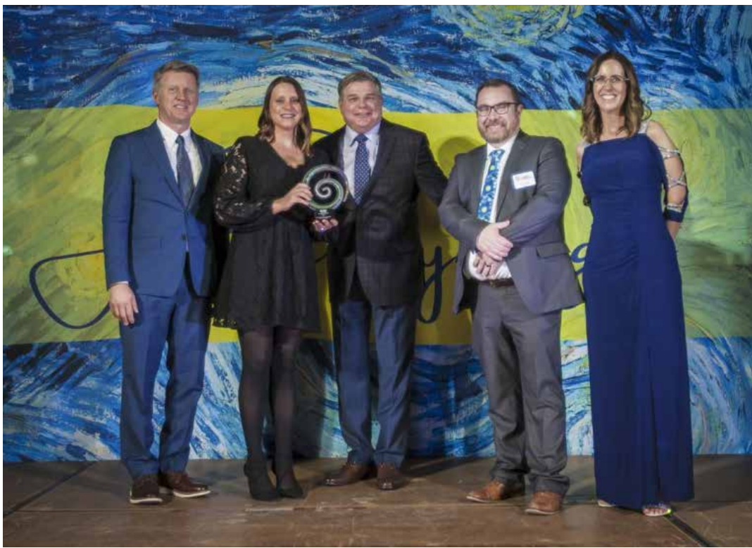
The EDC was awarded Non-Profit of the Year by the Wayne County Area Chamber of Commerce.