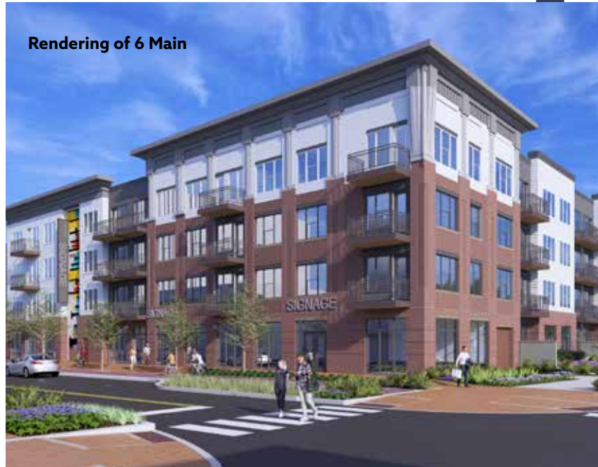
Rendering of 6 Main

The demolition of the former Elder Beerman department store began late in 2024 and was completed by January of 2025. Once site work is completed the property will be turned over to Flaherty & Collins to begin construction of the new 6 Main apartment complex. The complex will consist of 150 luxury market-rate units and many unique amenities. The EDC was happy to partner with the City of Richmond and Wayne County Government to bring this project to fruition.