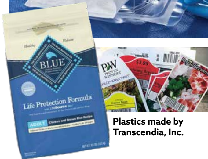
Plastics made by Transcendia, Inc.