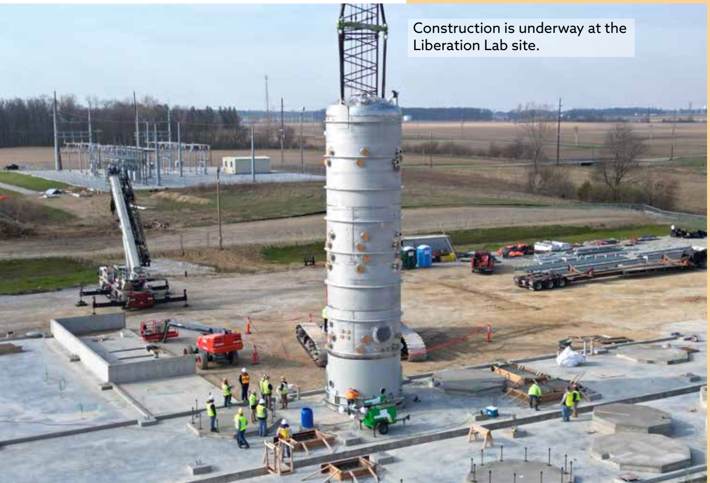
Construction is underway at the Liberation Lab site.