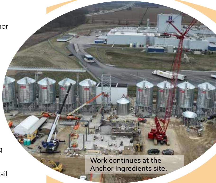
Work continues at the Anchor Ingredients site.

Another company that saw value in the proximity of a Norfolk Southern mainline, Anchor Ingredients, announced the construction of a transload and pet food ingredient processing facility in Phase II of the MIP. The new facility will position Anchor Ingredients in the heart of a growing pet food manufacturing cluster in east central Indiana and west central Ohio. The company broke ground on their new state-of-the-art facility on 36 acres of land purchased from Blue Buffalo which will expand rail infrastructure within the MIP and provide bulk storage, warehouse space, and onsite ingredient processing as well as the latest in quality assurance testing to meet the demands of their customers. The EDC supported the company by facilitating the negotiation of a $900,000 grant from the Richmond Redevelopment Commission to be applied towards the construction of an onsite rail spur. Anchor has also applied for an Economic Development Rider from RP&L and IMPA. This project will result in a minimum investment of $39M and the creation of 30 new jobs at an average hourly rate of $25/hour, plus benefits. We welcome Anchor Ingredients to the MIP and are excited to see what the future holds for the pet food sector in our region with this new project.