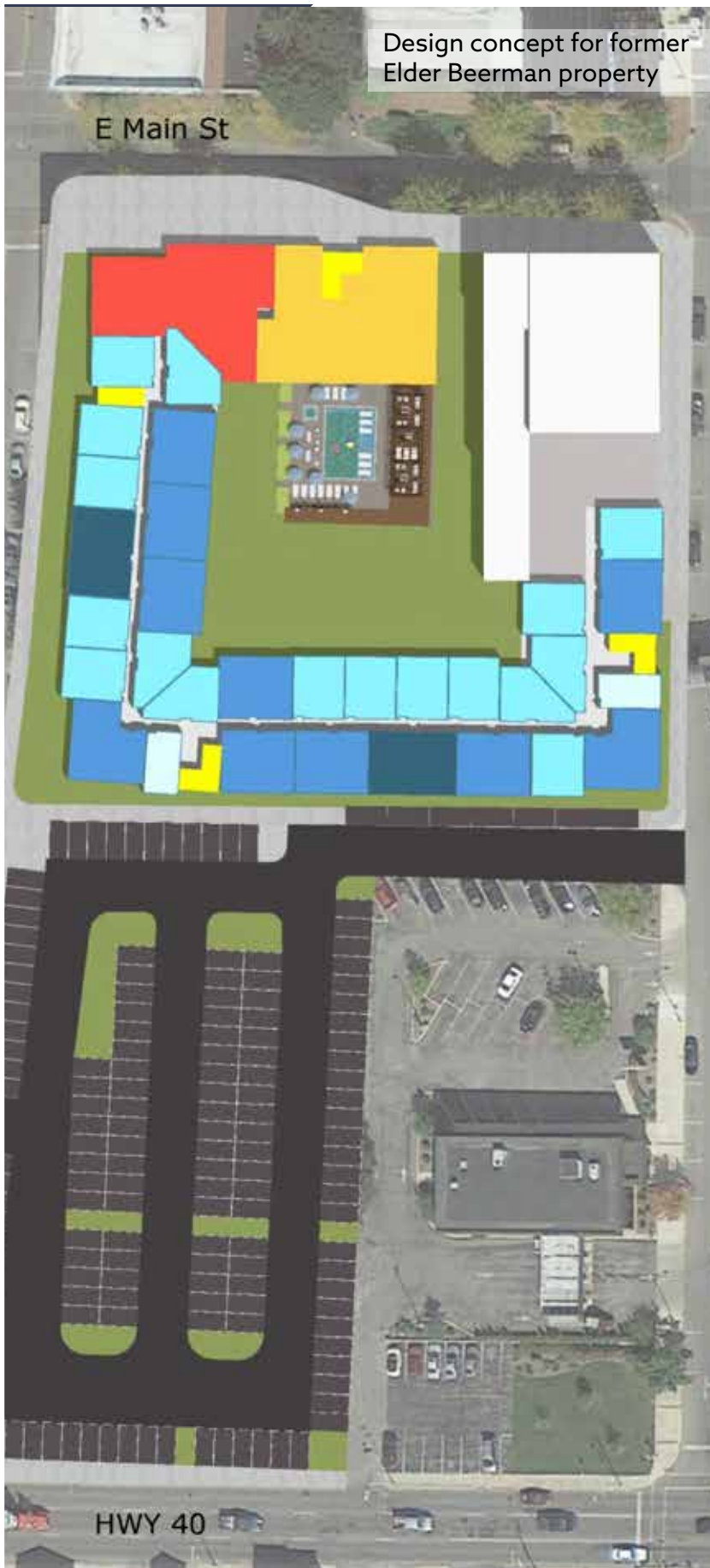
Design concept for former Elder Beerman property

The EDC is working with numerous housing developers to address housing shortages across all housing types throughout the county. In 2023 we re-engaged Tracy Cross & Associates to update our 2021 housing study that was outdated due to increases in housing costs, rental rates, and related construction costs. This 2023 report indicated shortages in all types of housing including market-rate and affordable, both for sale and for rent, and single-family and multi-family options. The revised housing study now includes affordable housing needs in addition to market rate to give a full picture of the housing demands in Wayne County impacting all residents. We ended the year working on nine different housing projects in various stages of planning and development.